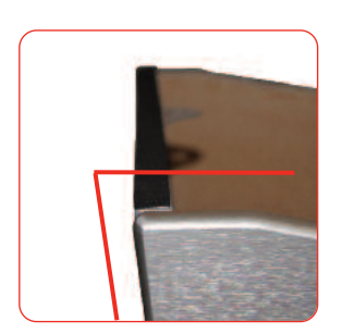
Ensure top of side is aligned/Parallel with front/rear face. Please note: The adhesive dot indicates the top.