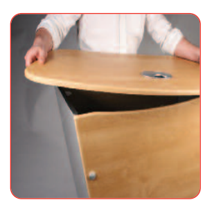
Lift the top onto the base of the unit