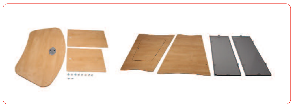
Kit includes: Top, front, back, 2x sides, 2x shelves, 8x turn parts and 2 x hand wheel nuts. Foam tape suppled but not applied (The above kit shown is a deluxe kit)