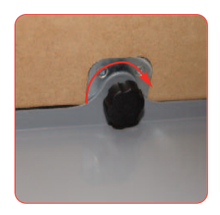
Once the table top is in place secure using hand wheel