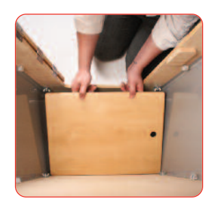
Insert the smaller of the two shelves at the bottom of the unit. Rest the shelf on the shelf locator. Repeat these steps with the upper shelf.Please note: 8 screws are supplied to fix shelves permanently