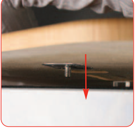
Lower the table top onto the base of the unit. Make sure the table top locators are in the locators on the sides of the unit.