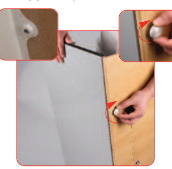
To build the base of the unit align front with the locators on the sides, Screw the turn parts through the front and into the side panel. Repeat this for the remaining sides